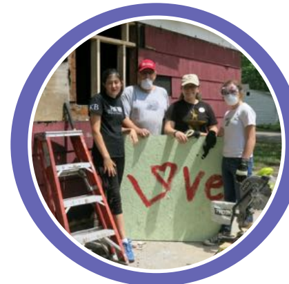
Volunteers from YNIA helping with the Darcy House in June

the help of supporters like you. If you are interested in helping with any of the strategic plans highlighted above, or you just want to hear more about what our plans for the future are, please contact us.