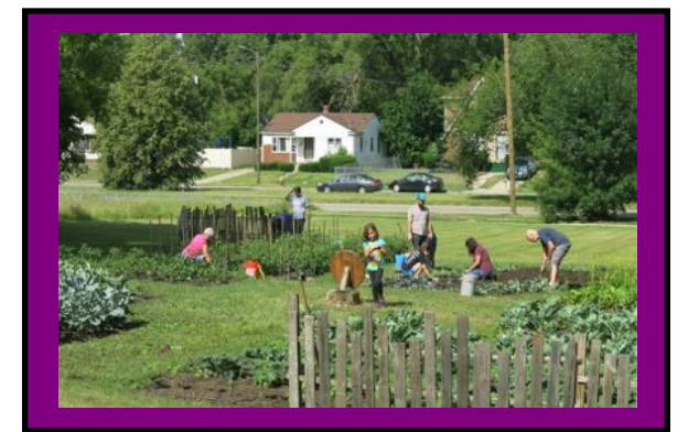
Volunteers from Berkley UMC working in the garden

The majority of our revenue comes from the generosity of our individual donors, including our "Brick Builders," who commit to make gifts of at least $1,000 annually for three years. We appreciate all of the support that our donors and Covenant Partnership Churches have provided.