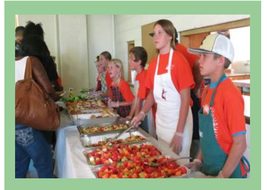
Youth from Chelsea helping serve lunch at Brightmoor in July

As RBI neared the end of its fifth year of working side by side with the neighbors of Brightmoor and Redford, we began to develop a strategic plan that would support our next five years. With help from a Skillman Foundation grant, the Board of Directors and staff of RBI refined our mission and vision and developed a plan that will drive our focus. Part of our Strategic plan directs RBI to: