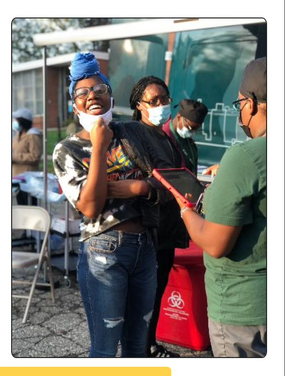
Donate here to keep these programs going!